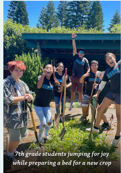
7th grade students jumping for joy while preparing a bed for a new crop