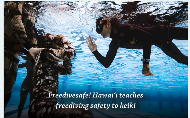
Freedivesafe! Hawai'i teaches freediving safety to keiki

Freedivesafe! Hawai'i was founded in August 2020 by a team of industry leaders to improve the safety of the spearfishing and freediving communities in Hawai'i. As the sport continues to grow in popularity, so too has the urgency to make this safety training accessible to our Island communities. This grant supported its Basic Freediving Safety program, which includes a five-hour course that educates young people ages 12–25 years old about proper freediving supervision and basic safety and rescue procedures.