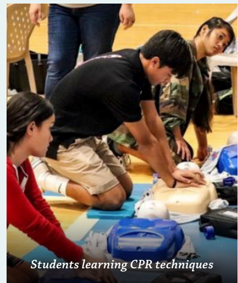
Students learning CPR techniques