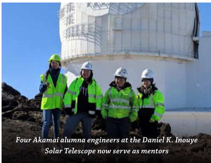
Four Akamai alumna engineers at the Daniel K. Inouye Solar Telescope now serve as mentors