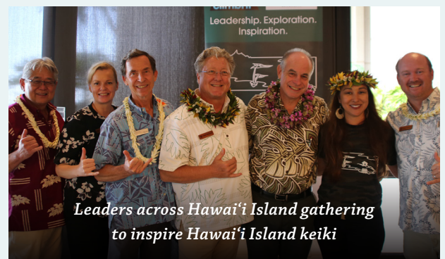
Leaders across Hawai'i Island gathering to inspire Hawai'i Island keiki

ClimbHI seeks to inspire students to finish high school and proceed to post-secondary education or employment by exposing them to future career paths and showing how to achieve those goals. It achieves this through three primary initiatives: The ClimbHI Bridge online portal, Leadership, Exploration, Inspiration in-person events, and the ClimbHI Service Excellence Certificate program through the Hawai'i State Department of Education. This grant supported the ClimbHI Bridge online portal that connects students and educators with local businesses that offer guest speaking, mentorship, job shadowing, internships, and more.