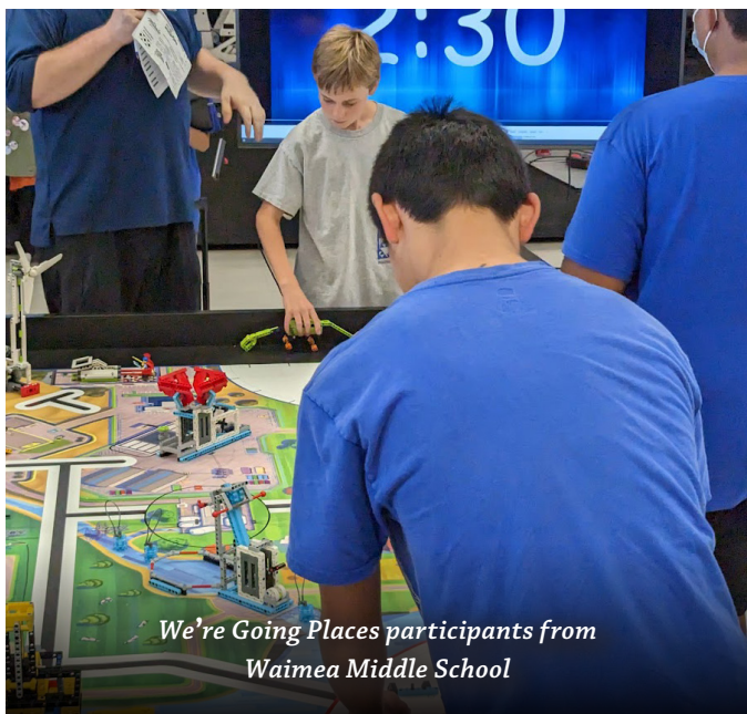
We’re Going Places participants from Waimea Middle School

In the seven years since Career Connected Learning (CCL) started, the Kūki‘o Community Fund has committed itself to supporting youth career preparation opportunities that have now grown into robust grassroots programs. KCF will continue to ensure that local K-12 students, including Kūki‘o employee children, receive hands-on, STEM-focused education in growing industries that pay higher-than-average wages, preparing them for careers that will better support the cost of living in Hawai‘i. The Kūki‘o Community Fund’s dedication to investing in career training ensures that our local students are prepared for innovative career opportunities in STEM fields on Hawai‘i Island.