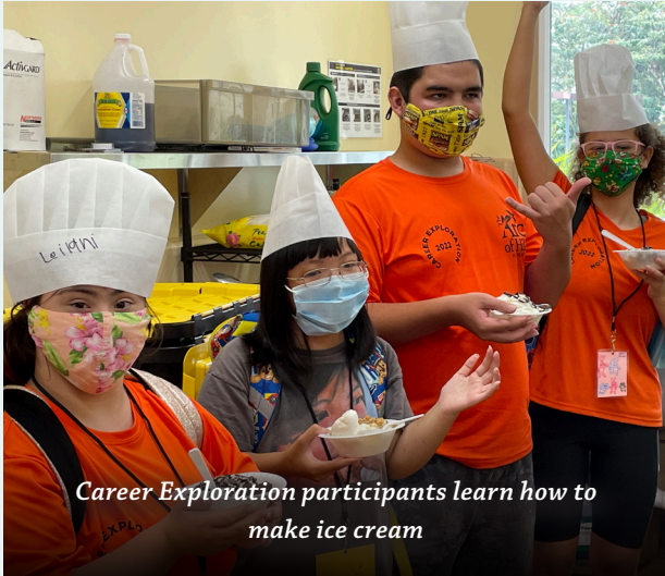
Career Exploration participants learn how to make ice cream

The Arc of Hilo was founded by a group of parents in 1954 advocating for youth, adults, and seniors with developmental disabilities. Their mission is to enrich the lives of those served through meaningful employment opportunities, community inclusion, advocacy, and access to affordable housing. This grant supported the new Career Exploration program, which provides transition-age youth the skills and experience they need to ready themselves for the workforce prior to age 22.